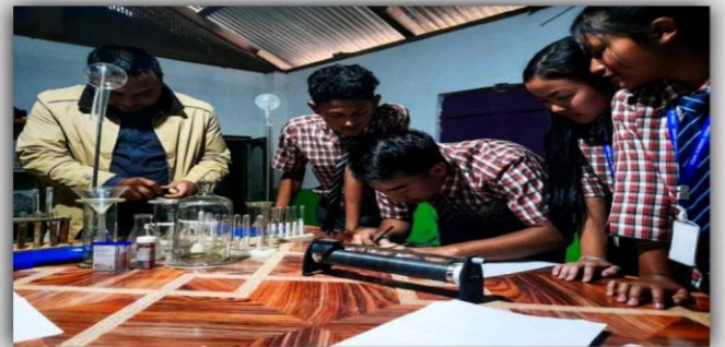
Activity based learning