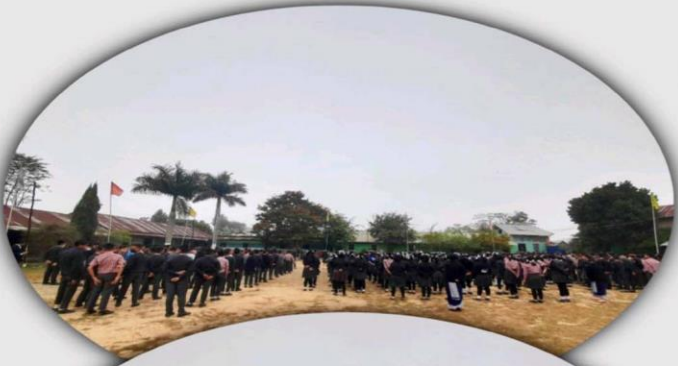
Different assembly grounds for kindergarten, primary, middle and high schools.