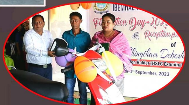
Award handover to 14th Position Holder HSLC - 2023