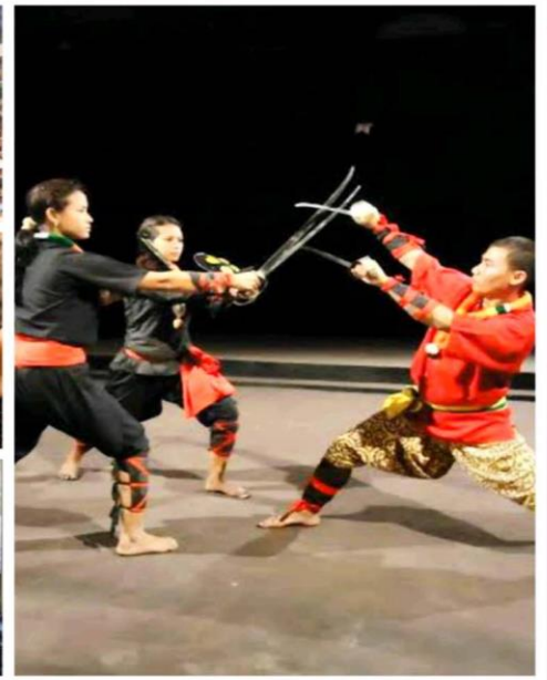
Extra curricular activities and classes