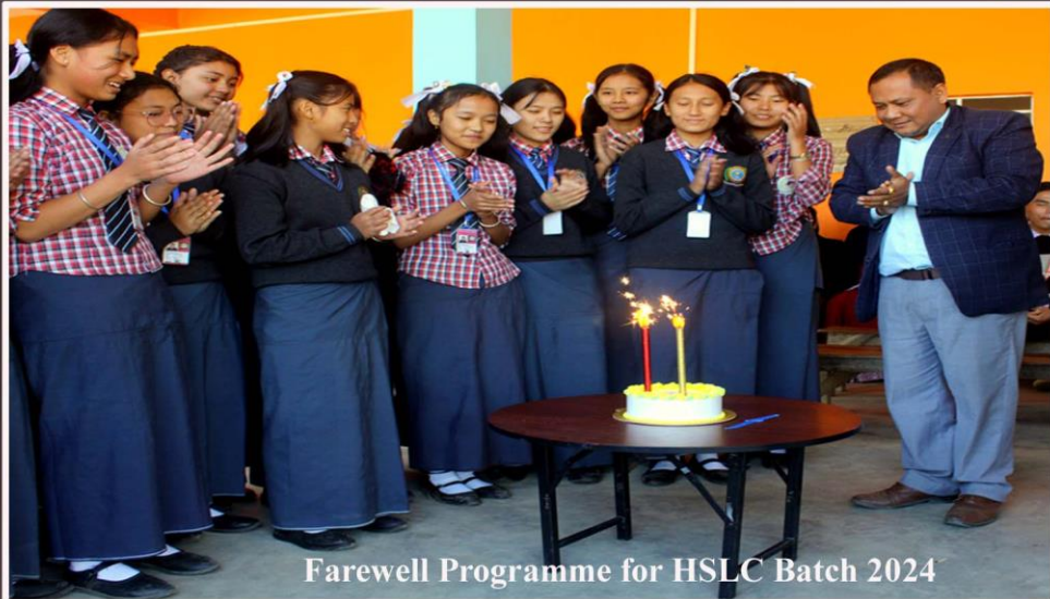
Farewell Programme for HSLC Batch 2024