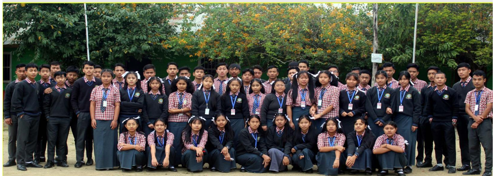
IVAS - HSLC BATCH 2023-24