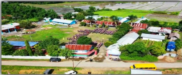
Safe and secure environment